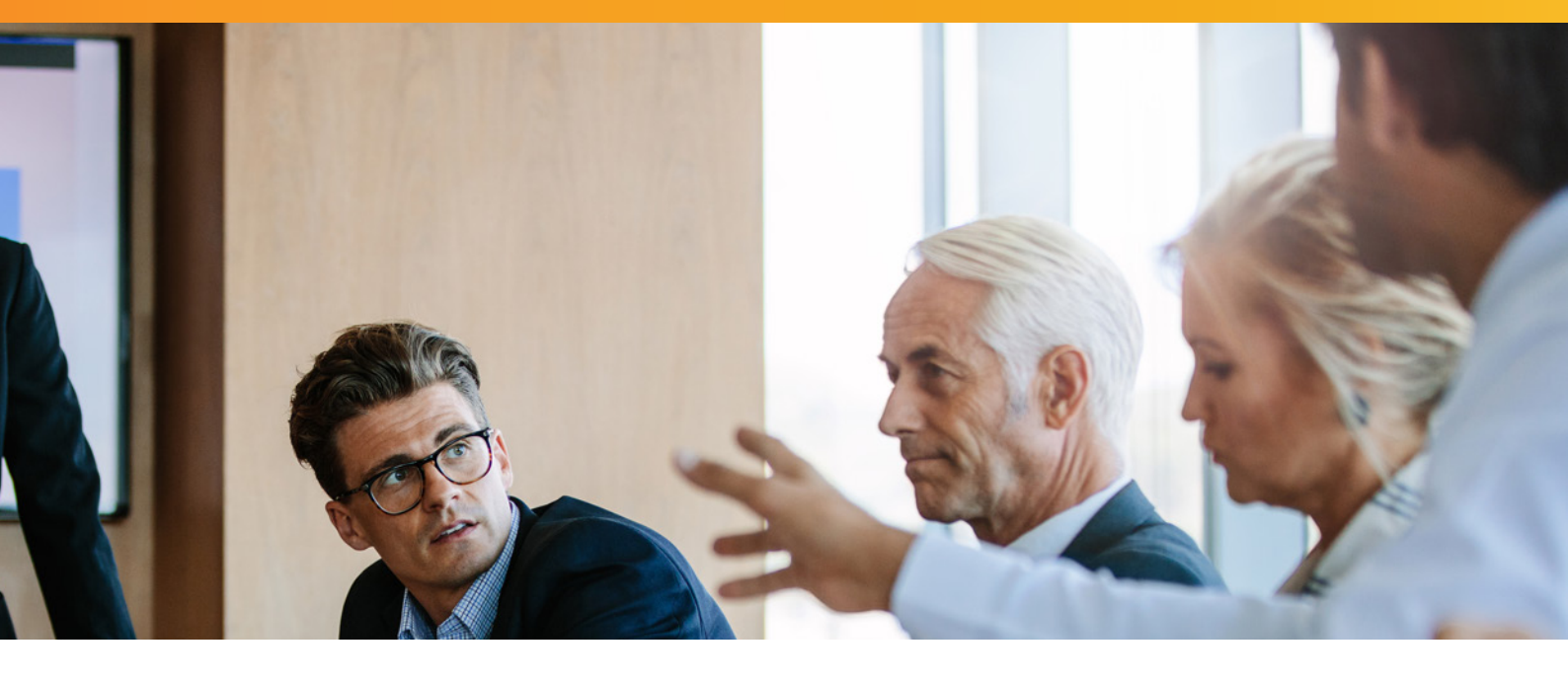
The ALB chair's stakeholder environment

MINISTER ALB BOARD CABINET OFFICE THE GENERAL PUBLIC SPONSOR DEPARTMENT CEO WIDER GOVERNMENT OTHER PUBLIC BODIES